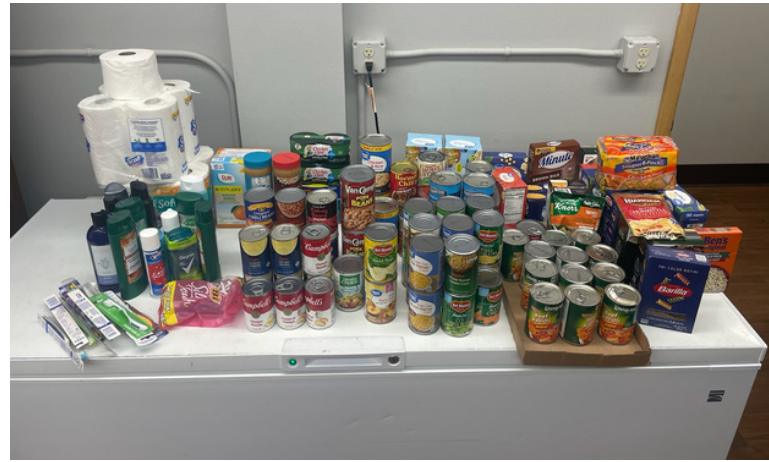
Feelhaver Students and Staff collect donations for the Lord's Cupboard Food Pantry.