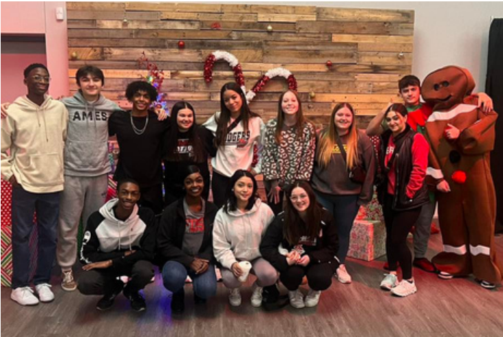
FDSH Students volunteered at a Santa and Grinch Meet and Greet event, hosted by UnityPoint Fort Dodge at Fort Frenzy.