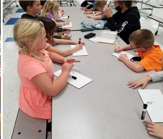
CAPTION: Working on math during Power Hour.