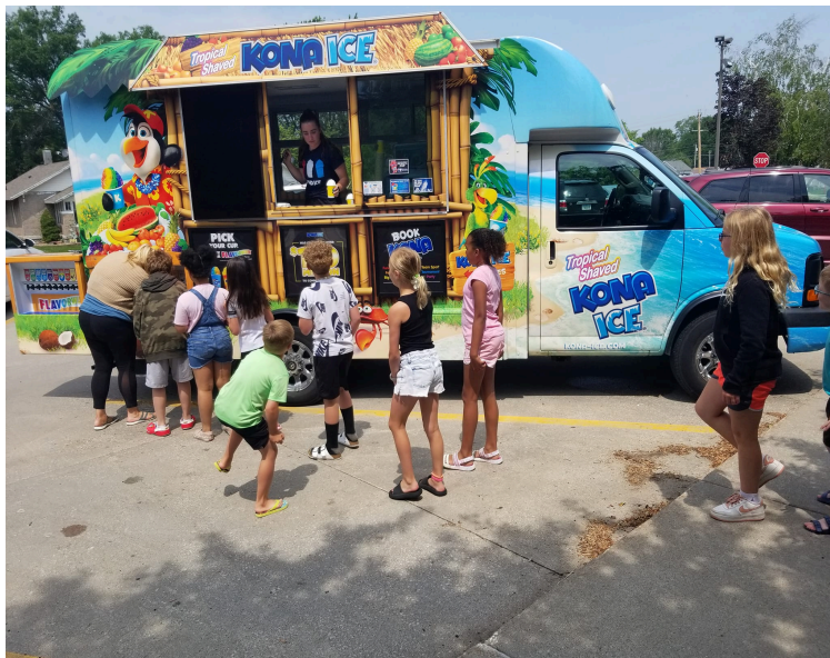
CAPTION: Enjoying a treat outside.