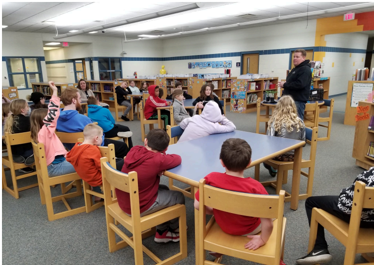
CAPTION: Meeting with a guest speaker from Smitty's Greenhouse. Learning about what it takes to make a garden grow.