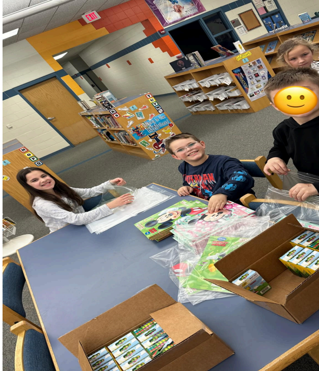
CAPTION: Packing bags that will be donated to the police department for when they respond to class that involve children. Bags include teddy bear, crayons and coloring book.